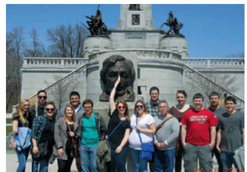
Springfield, IL, 2014