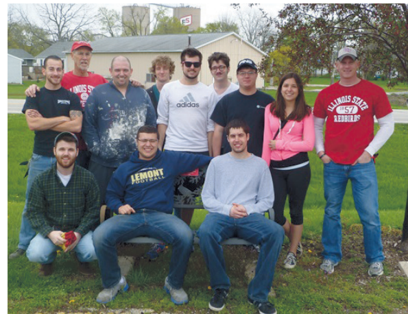
On Route 66, 2015

In partnership with the Chicago Public Schools and the ISU Chicago Teacher Education Pipeline program, Noraian also takes students to Chicago for two days as part of History 390. The students visit schools, museums, ethnic restaurants, explore culturally diverse neighborhoods, and have an opportunity to talk with community organizations as they learn more about collaborating and teaching. To acquaint them with the city and diverse communities that make up the school populations, Noraian organizes a scavenger hunt. Students go to grocery stores, pharmacies, and markets in order to obtain a wider understanding of the communities that surround Chicago Public Schools. The trip provides them with a way to envision their classroom in the future and consider teaching in urban environments. “When a student experiences something, they’re more likely to replicate it for their students