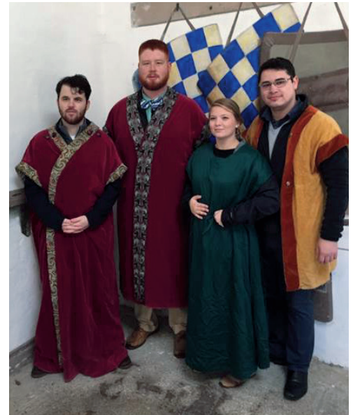
Student teachers in England