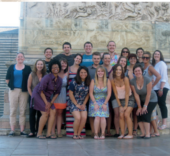
Orvieto, Italy, 2014

Around campus, History department faculty members are known for their passion for teaching and their dedication to students. This passion is