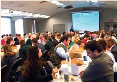
State Farm hosted lunch and a history lesson on the downtown building

Topics ranged from "What is Atlantic History?" to "Strategies for Teaching Writing in the Social Studies." The day ended at the