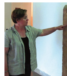
Tsouvala in Greece

The idea for this project unexpectedly came out of Tsouvala's dissertation. While researching her dissertation, Tsouvala found an inscription in a 19th century book that listed a woman's name among 66 male names in