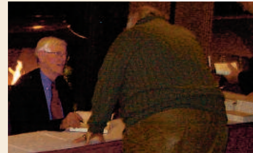
Gordon S. Wood signs books at the TAH Conference.