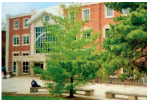
Our new home in the recently renovated Schroeder Hall