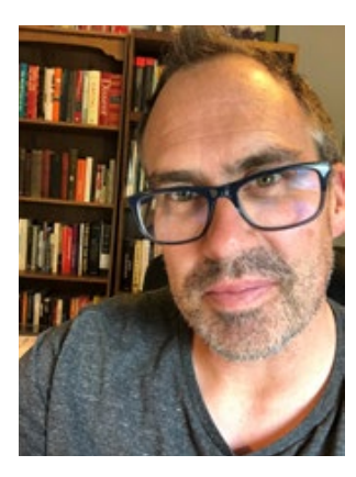
"I may have quit shaving in quarantine, but I haven't quit teaching—and gladly!"

and student teachers can continue to gain essential skills in high school classroom, even as those classrooms have moved online. Keep reading below to see how history faculty have worked to keep teaching so our Redbirds can keep learning.