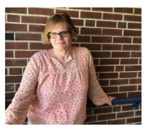
"I've discovered a benefit to holding grad seminars on Zoom: I can invite the authors whom I know to join the class for a little bit. I can do that otherwise, but it's just a lot easier to set up and more natural when we're all on Zoom. I just got through with my grad seminar, and the historian who wrote this week's text—a friend—joined us for about 30 minutes, and next week, another friend whose book we're reading will be joining us. That's fun."