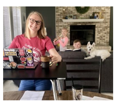
"I have the pleasure of sheltering-in-place with my husband, two kids, and dog. Nothing says family bonding like listening to recorder concerts!"