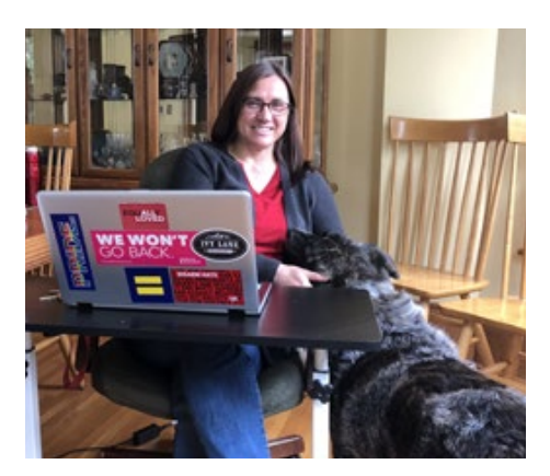
"COVID-19 can keep me out of the classroom, but it cannot keep me from my passion for teaching history. In this time of remote teaching I learned new ways of delivering information that enhanced student's knowledge of American history. This experience has been a growth opportunity for all of us. I love teaching and my students and am proud of all of them for rising to this challenge."