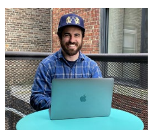
"I miss seeing my students in person, but have two silver linings: Recording podcast lectures for my classes has given me the opportunity to perfect my 'radio voice' and I got to receive the fun student feedback: 'Your lectures are perfectly timed for walks with my dog.'"