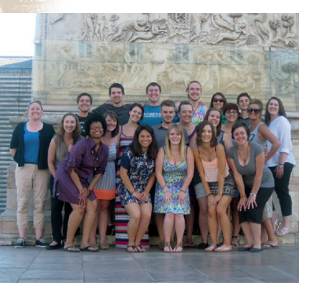
Orveito, Italy, 2014

Around campus, History department faculty members are known for their passion for teaching and their dedication to students. This passion is